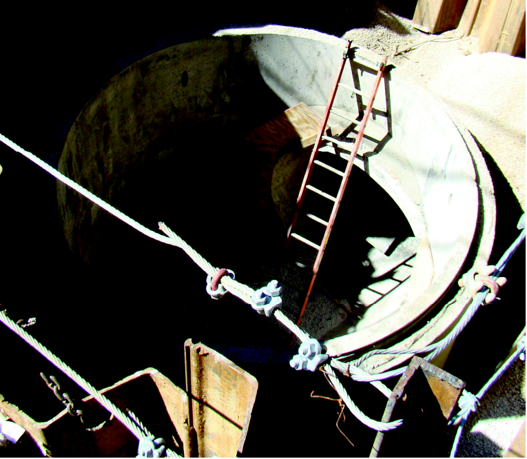
(Shown in the picture above is a sewer access portal)

All summer long, there has been construction activity at the corner of Harlan and Ravenswood Avenues. Blankenberger Brothers Construction has been busy making a connection with the 84” drain line on the other side of Highway 41. Most of their work for the year is done (in our neighborhood), but will pick back up again in the Spring of 2011.